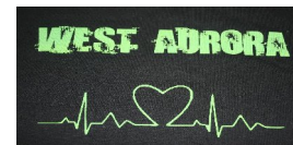
West Aurora Team

Diligent planning & contagious energy created 3 successful events.